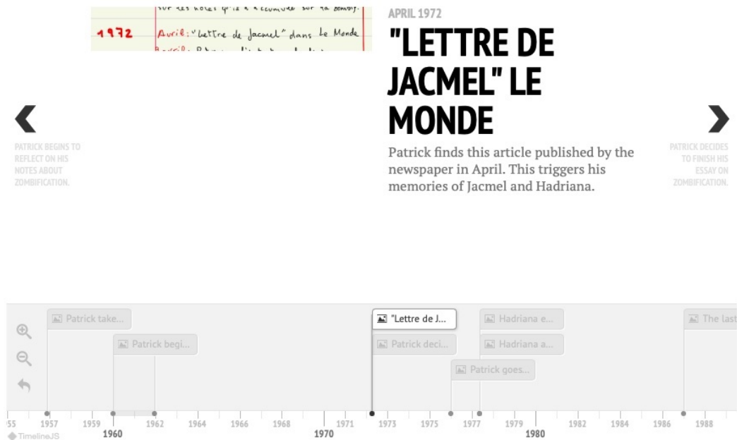
Figure 1.2 Lettre de Jacmel

all users had to walk. Moreover, paradoxically, I needed my project to invite readers to keep transgressing linear time even though I was offering them a timeline.