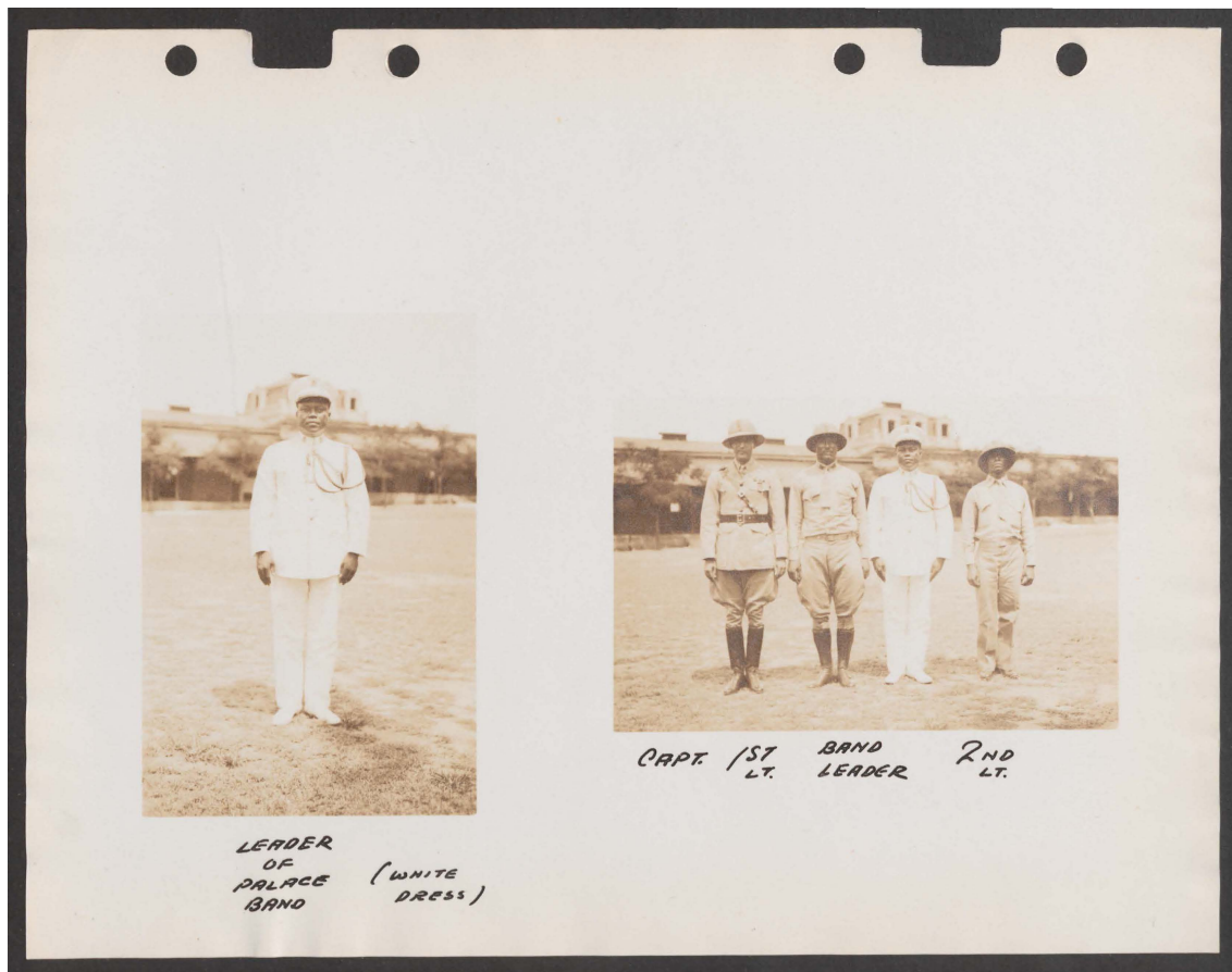
Figure 1.1 Monograph image of the Garde d'Haiti.

The Monograph's aerial photos are not portraits cataloged by projects of biological racism; the violence and erasure they perform are of a different sort. Instead of a gaze that meets the camera, defiant or opaque, an invisible gaze behind the camera animates a visual operation that has its roots in that of the all-seeing agent of plantation goings-on. Aerial vision, or seeing from above, has semantic and genealogical resonances with what Nicholas Mirzoeff names as “oversight.” Oversight extends the “nomination of what was visible to the overseer on the plantation” to address the sensory primacy of the visual in the ordering of slavery and as a perceptual practice underpinning western epistemes in general. 10 Plantation visibility operates through “a combination of violent enforcement and visualized surveillance” meant to manage time and labor to extract the biomass of cash crops. 11