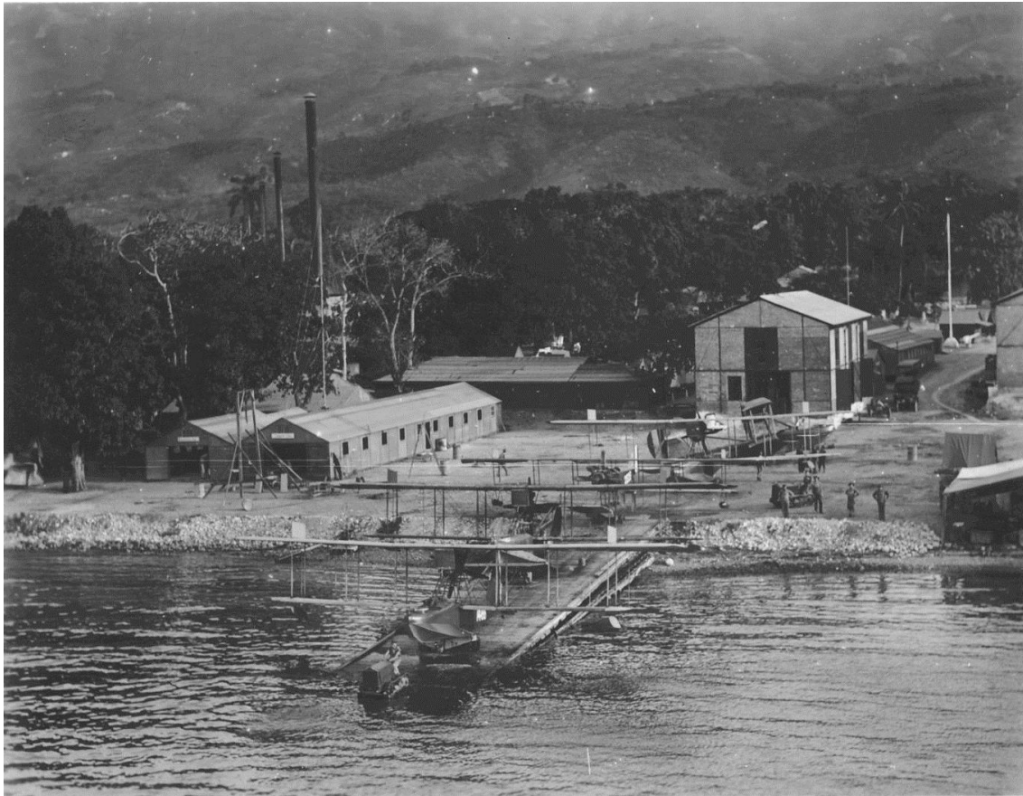
Figure 1.4 insert title here

through georeferencing, I thought about resistant forms and configurations of life, and about the embodied refusal of occupying forces.