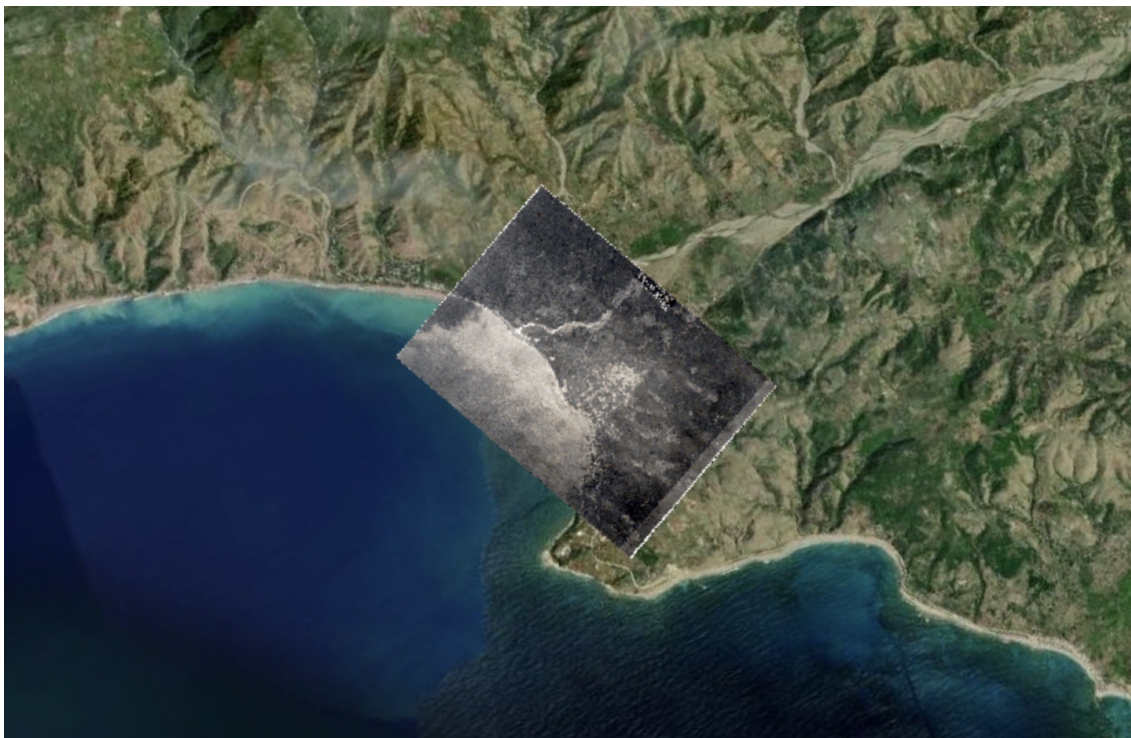
Figure 1.3 insert title here